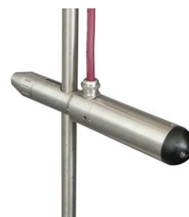
mobile ADCM Sensor for use with wading rod