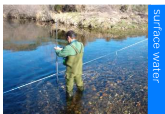
Application in River