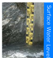
Surface Water Level