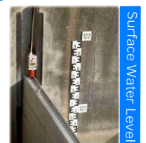
Surface Water Level