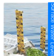
Surface Water Level