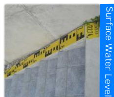
Surface Water Level