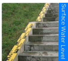
Surface Water Level