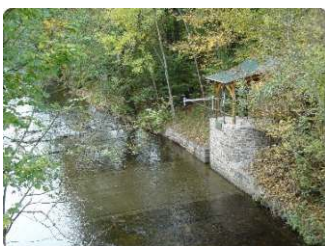
water level monitoring