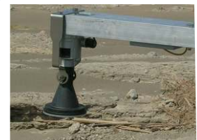
measurement in arid zone