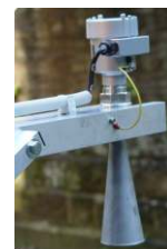
standard fixing device