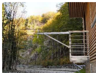
measurement of surface water